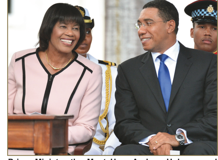
Prime Minister the Most Hon. Andrew Holness and former Prime Minister the Most Hon. Portia Simpson Miller, share a light moment during the March 3 swearing-in ceremony at King's House.

Excellency the Most Hon. humility" that he took the Sir Patrick Allen.