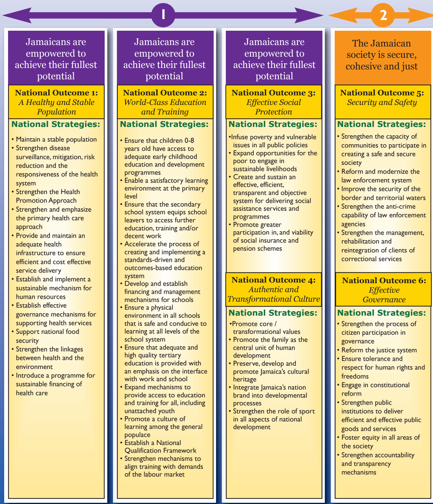
Table 1: National Strategies Linked to Goals and Outcomes