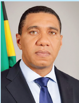
Prime Minister the Most Hon. Andrew Holness

The aim is to support the development of regulatory