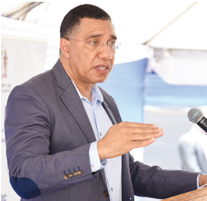
Prime Minister the Most Hon. Andrew Holness addresses the official groundbreaking ceremony for the new Little London Police Station in Westmoreland on April 7.

He stressed that there is an emergency in the country and the Government and