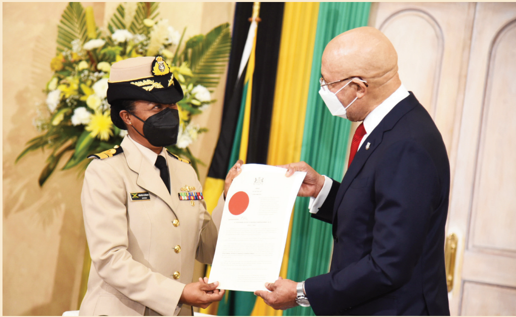
Governor-General His Excellency the Most Hon. Sir Patrick Allen presents newly installed Chief of Defence Staff, Rear Admiral Antonette Wemyss Gorman, with the Instrument of Appointment, during the swearing-in ceremony at King's House on January 20.

HISTORY WAS created when Rear Admiral Antonette Sandra-Lee Wemyss Gorman was installed as the Jamaica Defence Force's (JDF) first female Chief of Defence Staff (CDS) on January 20.