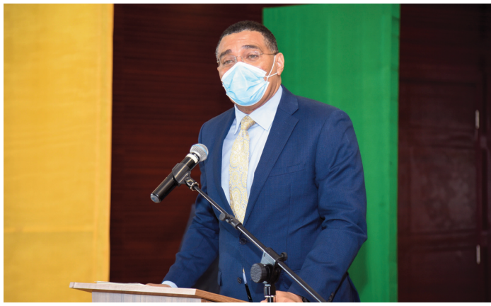
Prime Minister the Most Hon. Andrew Holness addresses the official opening and naming ceremony for the new headquarters of the Ministry of Foreign Affairs and Foreign Trade, located in downtown Kingston, on January 19.

Addressing the official opening of the Ministry of Foreign Affairs and Foreign Trade's new headquarters in downtown Kingston on January 19, Mr. Holness urged Jamaicans to adhere to the measures that have been implemented under the Disaster Risk Management Act (DRMA), noting that tighter COVID-19 measures could result in further economic setback for the country.