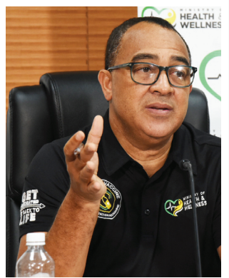
Minister of Health and Wellness, Dr. the Hon. Christopher Tufton, addressing the COVID Conversations digital press conference on January 20.

"I am very happy to note that we are finally commissioning the use of the machine. We do hope to get another machine sometime in the near future but for