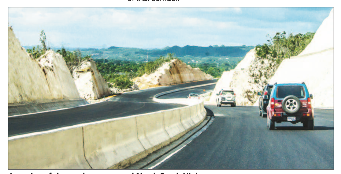
A section of the newly constructed North-South Highway