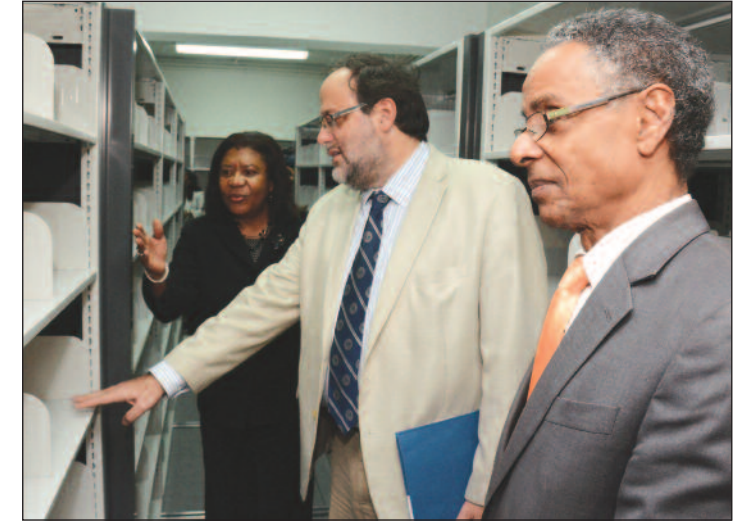
Justice Minister, Senator the Hon. Mark Golding examines the state-of-the-art High Density Filling System, at the official handing over of the Public Building North of the Supreme Court, Downtown Kingston. Looking on are Chief Justice, Hon. Zaila McCalla (left) and Attorney General Hon. Patrick Atkinson.