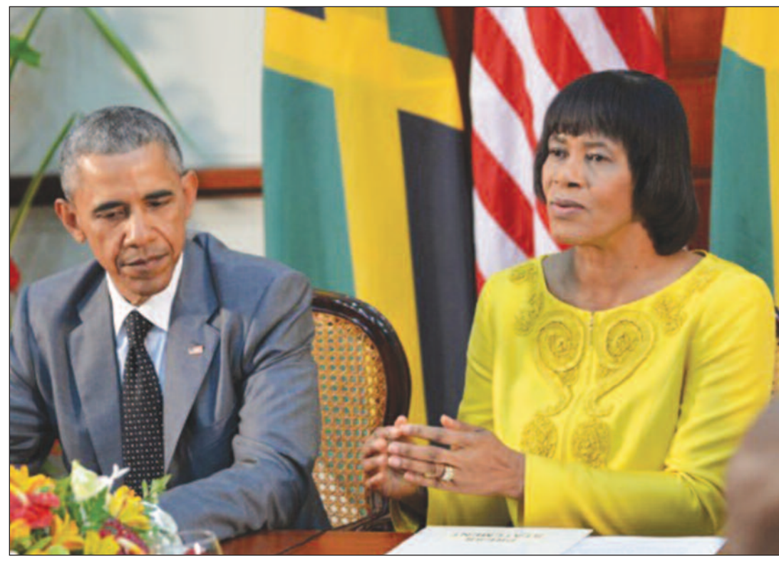
Prime Minister the Most Hon. Portia Simpson Miller (right) addressing journalists following the bilateral meeting with United States President, Barack Obama, at Jamaica House in April. Both leaders had wide ranging discussions on key issues of mutual interest, including national security, climate change, and energy. The meeting formed part of activities for the two-day visit to Jamaica by President Obama, from April 8 to 9, which included Caribbean Community (CARICOM) Heads of State and Government.