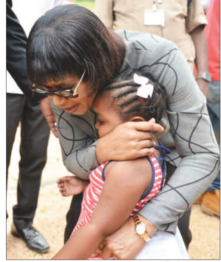
Prime Minister the Most Hon. Portia Simpson Miller hugs a young resident of Balaclava, in St. Elizabeth.