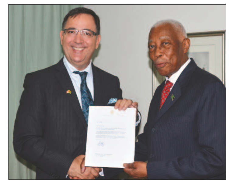
Minister of Foreign Affairs and Foreign Trade, Senator the Hon. A.J. Nicholson, (right), receives Letters of Credence from Canada's High Commissioner to Jamaica, His Excellency Sylvain Fabi, shortly after his appointment in 2015.

South Africa's Minister of International Relations and Cooperation, the Hon. MaiteNkoana-Mashabane