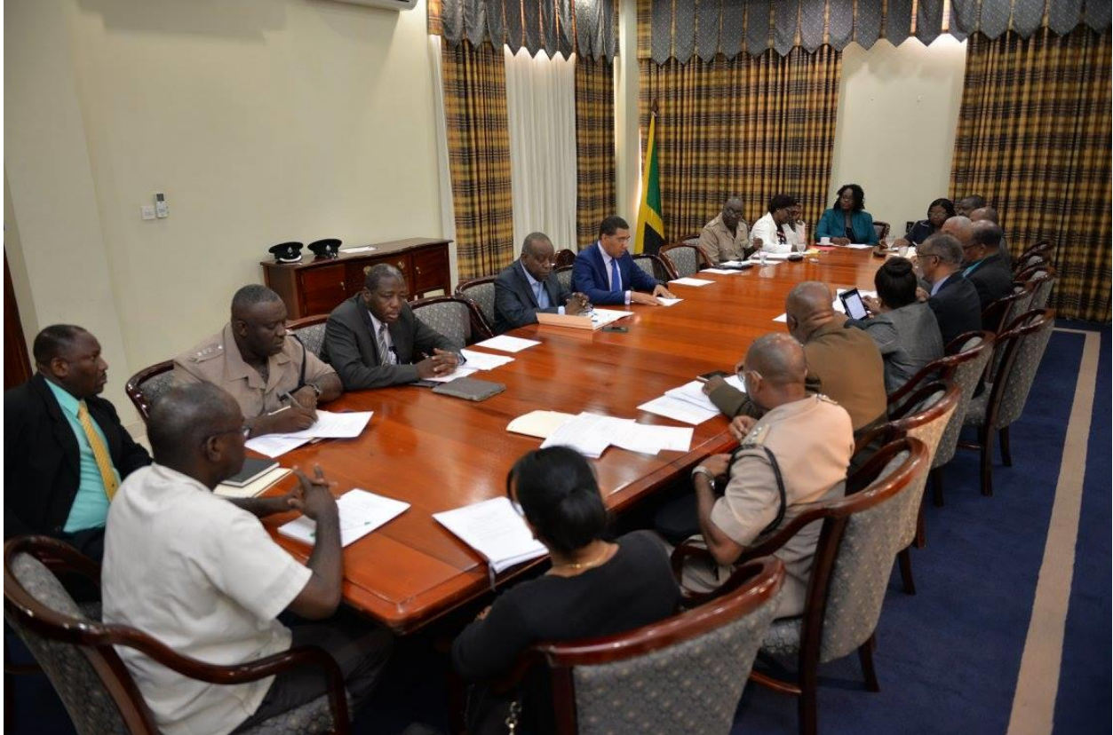
Figure 3 Prime Minister Holness meets with Members of the National Road Safety Council and the Road Safety Unit at OPM in June 2016