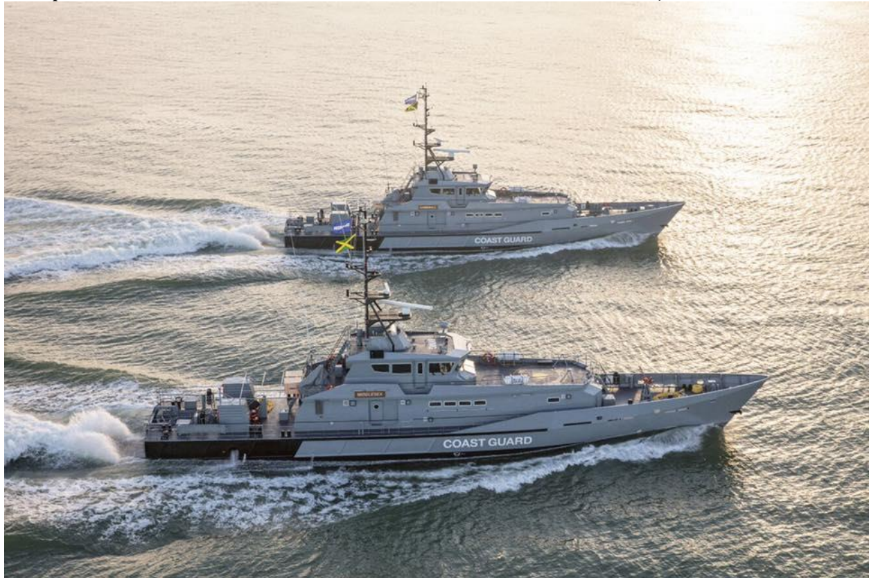
Figure 5 Her Majesty Jamaica Ship (HMJS) Cornwall and HMJS Middlesex

Mr. Speaker, I will now address some of the areas of the Plan Secure Jamaica .